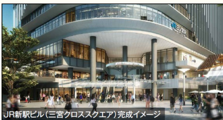
JR New Station Bldg. (in Sannomiya Cross Square)

A smooth connection between buses and trains in Sannomiya, easy for both locals and tourists to understand. Sannomiya will be the starting point for many to enjoy shopping, art, and delicious food, as well as have exciting encounters on their walks.